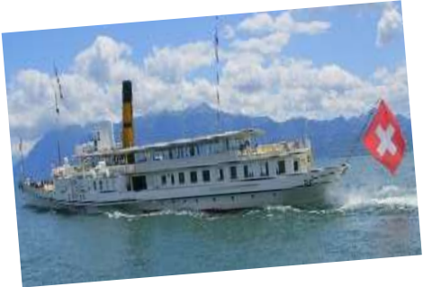
Your SWISS-MGV8/IG (Interest Group), OrganisingTeam of volunteers: